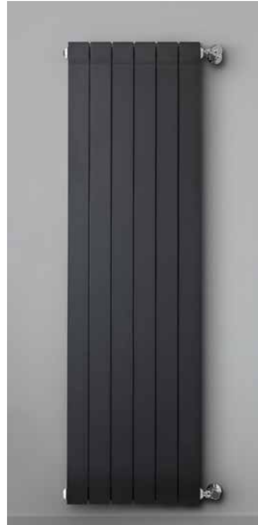
CLASSIC: BLACK COFFEE